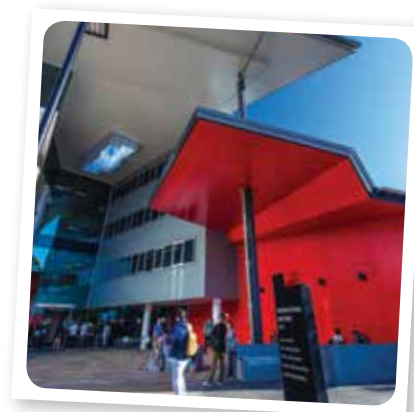
Gold Coast Campus

Griffith's Gold Coast campus is the largest of their five campuses and is very close to the beach. After a class in one of the state-of-the-art learning centres, you can catch the light rail to the beach to study outdoors or have a rejuvenating swim.