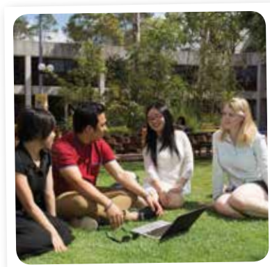
Mt Gravatt Campus

As a Griffith College student, you are so close to Griffith University you are already there. Griffith College is based on campus at Griffith University's Mt Gravatt and Gold Coast campuses.